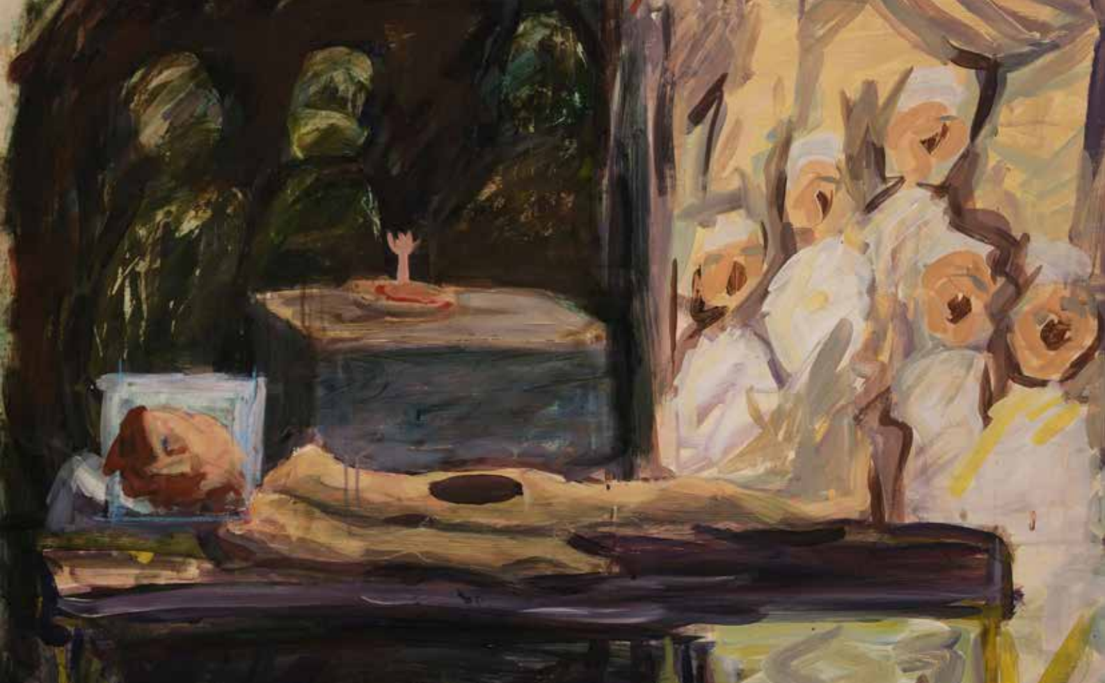
'Jingle Bells' / 1988 / 60 X 91 cms / Acrylic on board / IMMA Collection