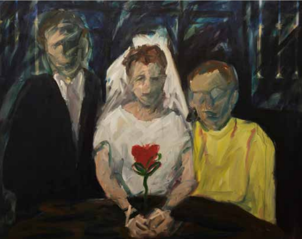
'Act of Union (Once Upon a Time)' / 1986 / 152 X 182cm / Oil on canvas / IMMA Collection.